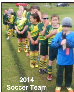
2014 Soccer Team

Ladysmith will once again play in the Small Schools Football (soccer) Knockout. We have been fortunate to have the local football association supply us with a coach who has been attending each sport session, plus additional sessions during the week.