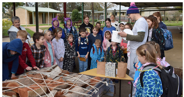
The students waiting in anticipation